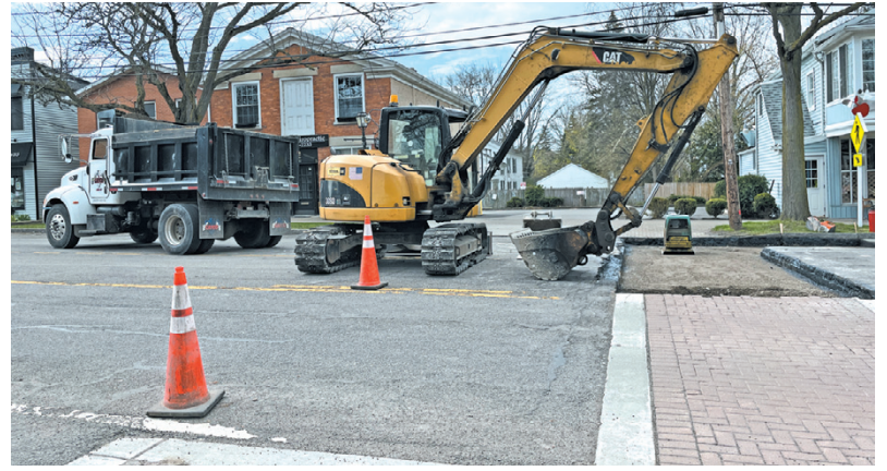
Laborers continued removing crosswalk bricks on Center Street this week. The roadway renovation project will take its next step Monday, when milling is scheduled to begin.

To this point, crosswalk bricks have been removed, and underground electrical infrastructure has been adjusted in anticipation